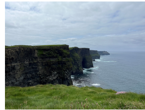
Cliffs of Moher